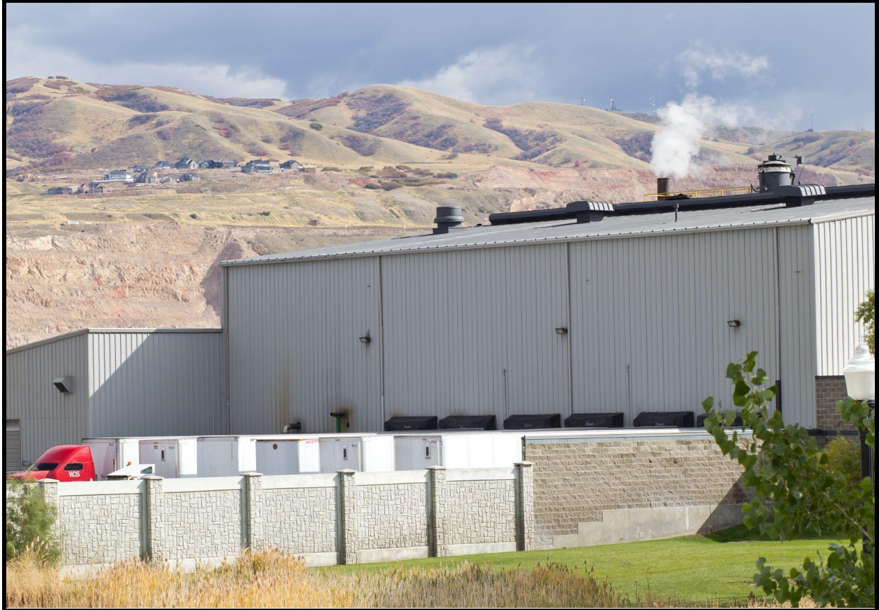
Stericycle, Inc.'s medical waste incinerator in North Salt Lake