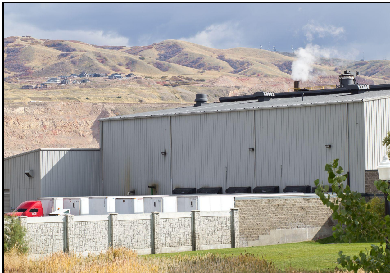
Stericycle, Inc.'s medical waste incinerator in North Salt Lake